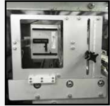
Mounted on a Vertical Bagger